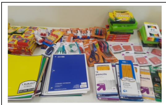
School supplies for Focusing Families